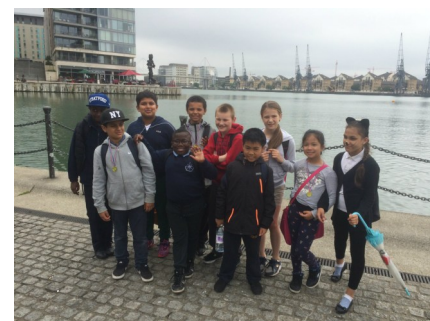
The group visit Royal Docks

Back on dry land the fun didn't stop as the children watched a dynamic performance of African dance and music. They also had the chance to explore vintage police vehicles, army transport and fire trucks, all the while being serenaded by local school choirs. To round off a