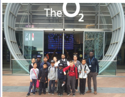
The victorious Ranelagh group